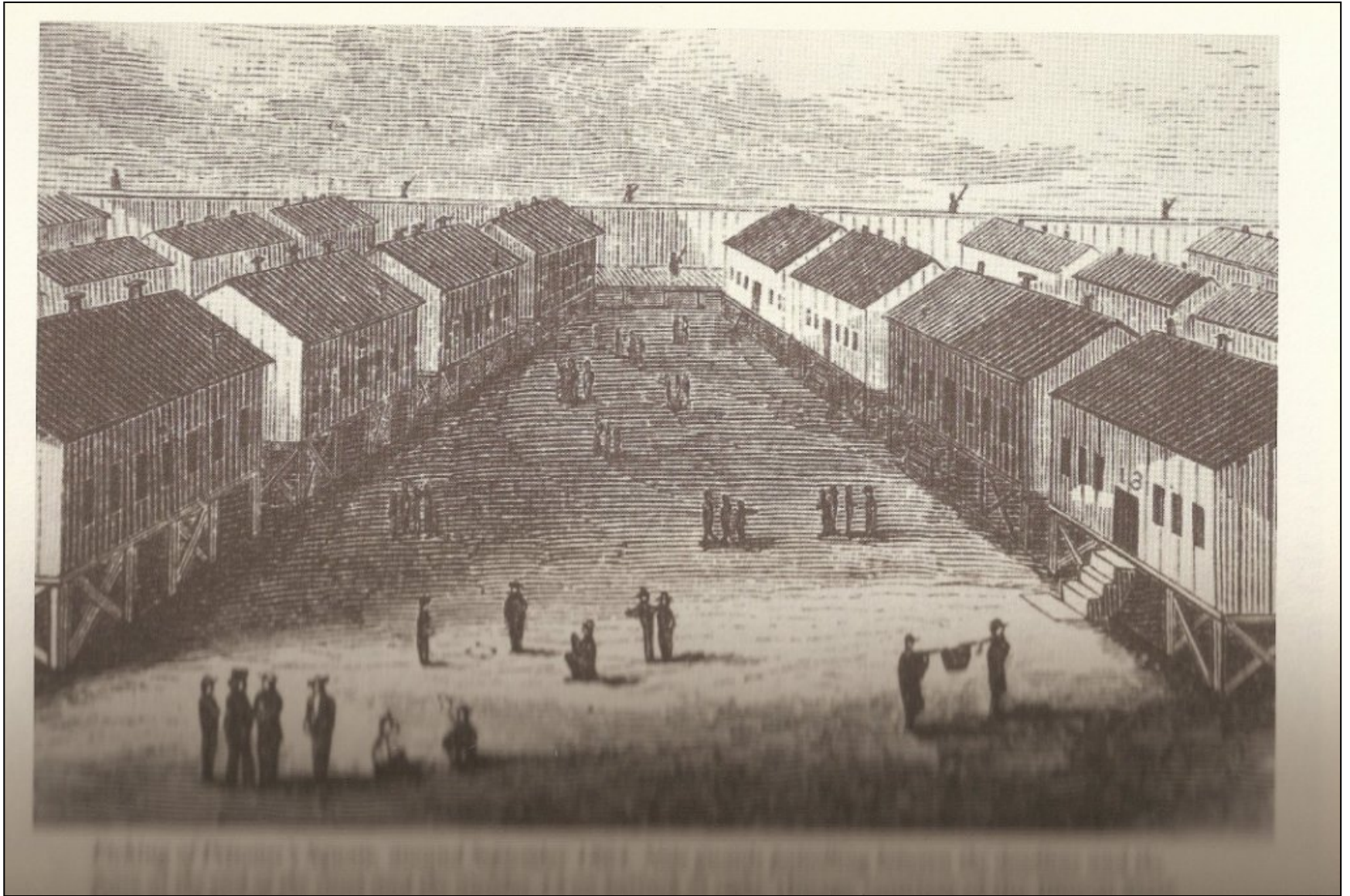
Camp Douglas Barracks