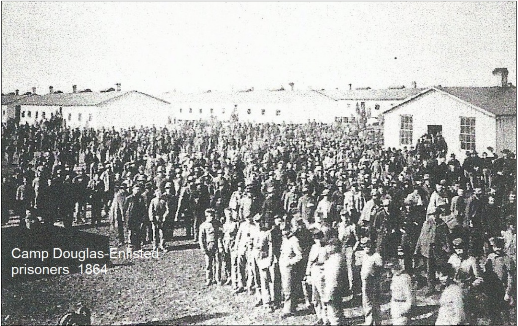
Camp Douglas-Enlisted prisoners 1864