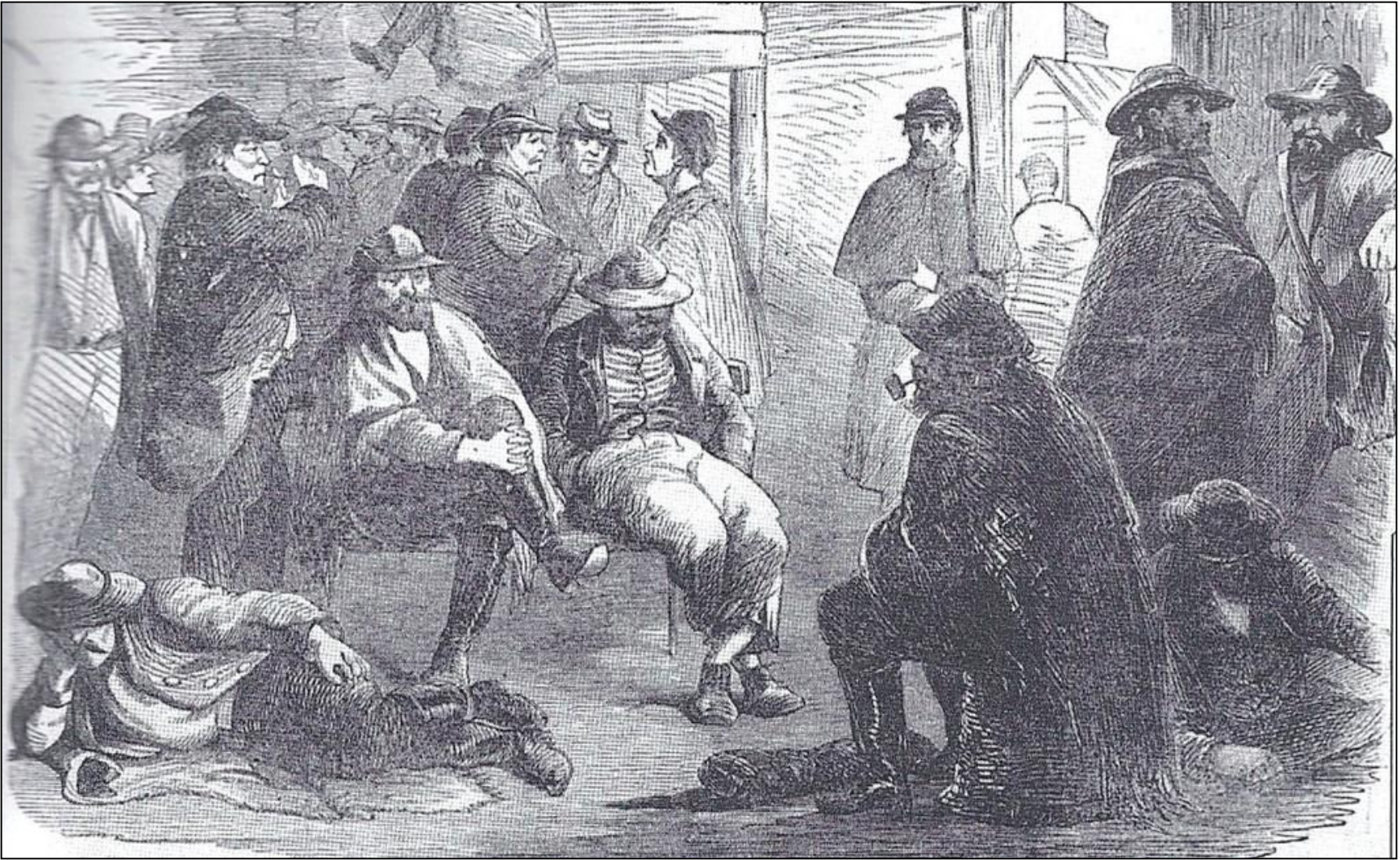
Confederate Prisoners Inside a Barracks